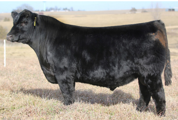
May-Way Unanimous E109 is a direct son out of 1372 who was a high seller in our 2019 sale going to Wheatland Cattle of Saskatchewan, Canada.