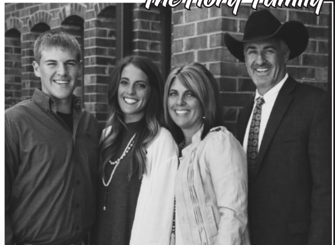
The Flory Family