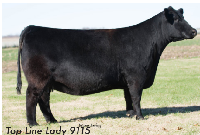
Top Line Lady 9115