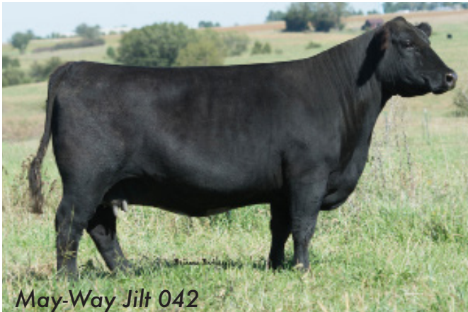
May-Way Jilt 042