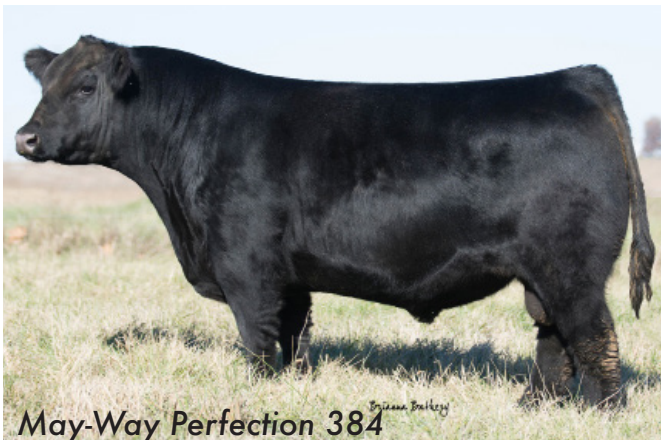
May-Way Perfection 384