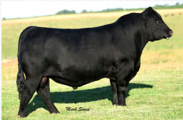
May-Way Equity: Sire of lots 21-29, 51, 62