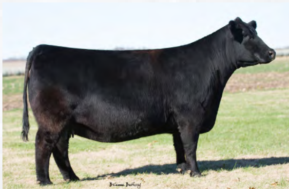
Top Line Lady 9115: Donor dam of lots 34 & 35. Paternal granddam of lots 36, 37 & 61.