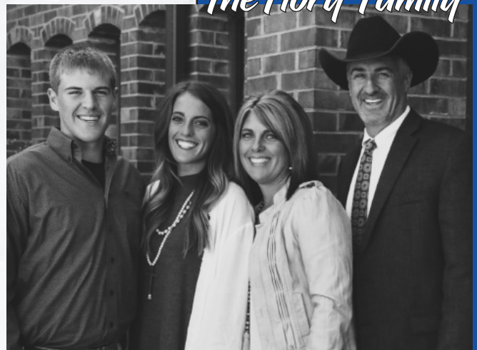
The Flory Family