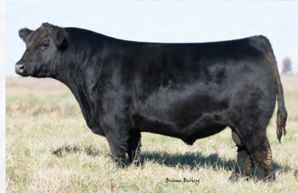
May-Way Perfection 384: Sire of lots 13-20, 40