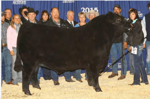
May-Way Breakout 1310: Supreme Bull 2015 Canadian Agribition for Poplar Meadows Angus. Sire of lots 30-33 & maternal brother to lot 52